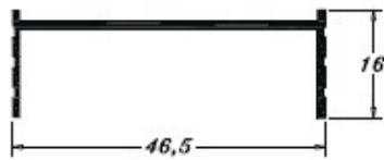
U 653 0,230 Kg/m