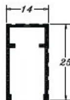
U 1002 0,191 Kg/m