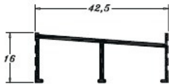
E 256 0,270 Kg/m